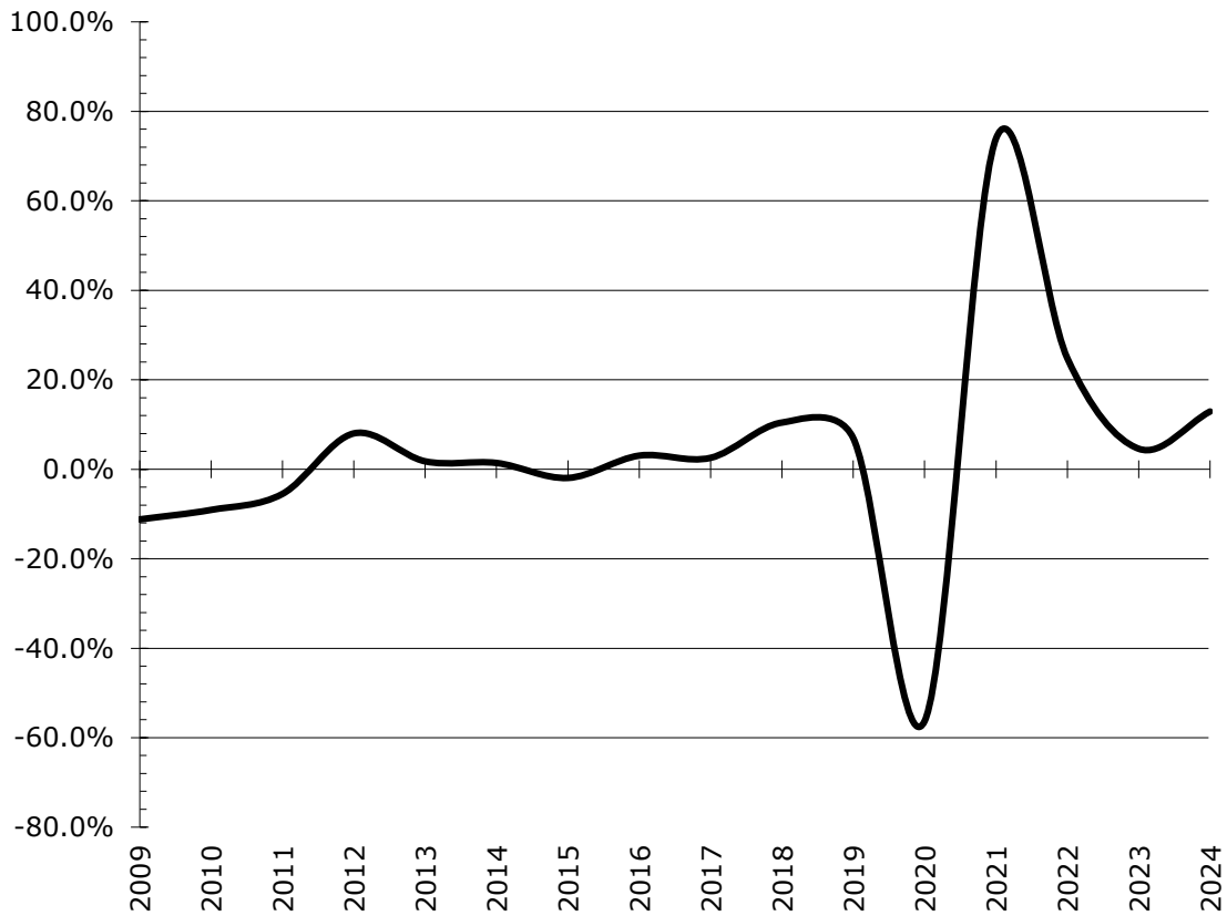
Total Passengers, Percent Change from Previous Year

Trend: Passenger traffic at Tallahassee International Airport in 2024 increased by 12.9% compared to 2023.